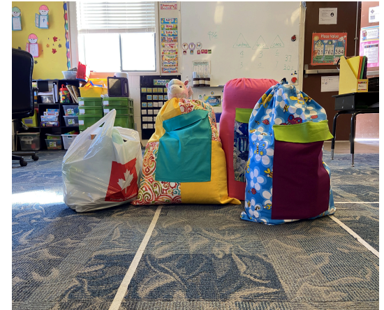
("Bags of Love" students packed for the Chilliwack community)

CACS is a coeducational institution offering grades kindergarten through eight.